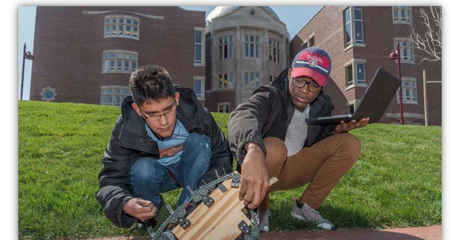
Ritchie School students at work